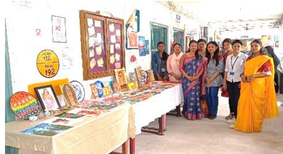
Incubation Centre Exhibition cum Sale for Unit of Painting and Modern Art, Unit of Arts