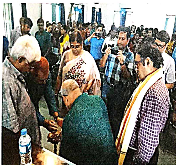
The moment of lamp-lighting in National Seminar