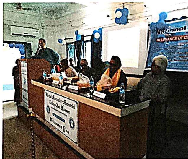
Honorable Speakers are seated on the dais

12/1/2018 Principal Hiralal Mazumdar Memorial College For Women Dakshineswar, Kolkata-700 035