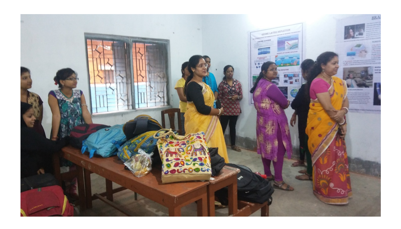
Visit at Sister Nivedita's House at Baghbazar, Kolkata