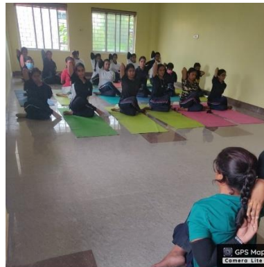
17, Jadunath Sarbobhouma Ln, Dakshineswar, Kolkata, West Bengal 700016, India

Latitude 22.65651433° Longitude 88.36087963° Local 12:13:13 PM Altitude -37.79 meters GMT 06:43:13 AM Tuesday, 21-06-2022