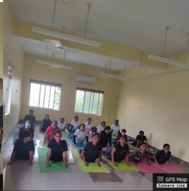
17, Jadunath Sarbobhouma Ln, Dakshineswar, Kolkata, West Bengal 700016, India

Latitude 22.6565413° Longitude 88.36084944° Local 12:07:58 PM Altitude -38.21 meters GMT 06:37:58 AM Tuesday, 21-06-2022