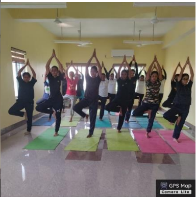
17, Jadunath Sarbobhouma Ln, Dakshineswar, Kolkata, West Bengal 700016, India

Latitude 22.65653734° Longitude 88.36086649° Local 12:09:03 PM Altitude -36.91 meters GMT 06:39:03 AM Tuesday, 21-06-2022