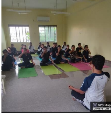
17, Jadunath Sarbobhouma Ln, Dakshineswar, Kolkata, West Bengal 700016, India

Latitude 22.65664764° Longitude 88.36077963° Local 11:40:30 AM Altitude -40.99 meters GMT 06:10:30 AM Tuesday, 21-06-2022