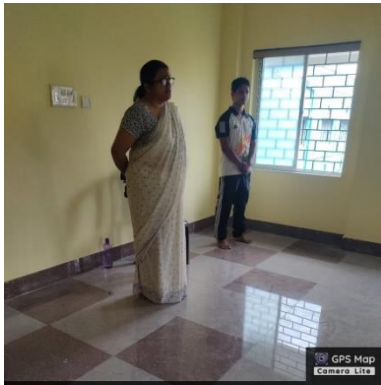
18, JNS Rd, College Para, May Dibas Pally, Dakshineswar, Kolkata, West Bengal 700076, India

Latitude 22.65664764° Longitude 88.36077963° Local 11:40:30 AM Altitude -40.99 meters GMT 06:10:30 AM Tuesday, 21-06-2022