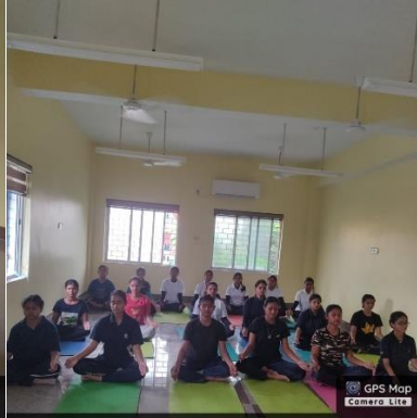
17, Jadunath Sarbobhouma Ln, Dakshineswar, Kolkata, West Bengal 700016, India

Latitude 22.65651495° Longitude 88.36087874° Local 12:14:21 PM Altitude -38.09 meters GMT 06:44:21 AM Tuesday, 21-06-2022